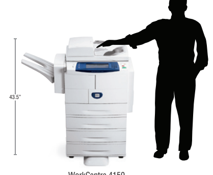
WorkCentre 4150 Floor standing model